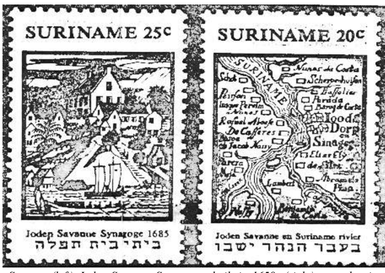
Stamps: (left) Joden Savanne Synagogue built in 1658; (right) map showing early Jewish Plantations on Surinam river

scientists and explorers took the bait. Their main target was Pernambuco, with its capital of Recife. They also made their way to Bahia and Rio de Janeiro. And they opened up Brazil.